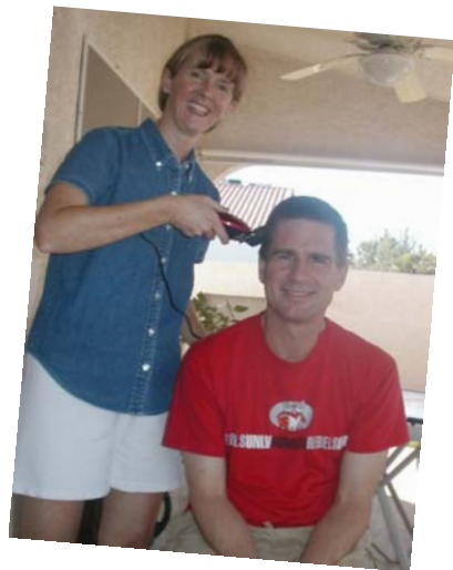
The Africa Buzz