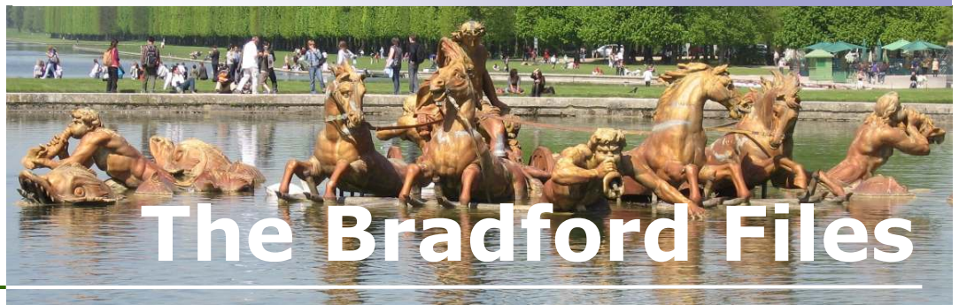
Fountain at Versailles

"I will also make You a light of the nations so that My salvation may reach to the end of the earth." Isaiah 49:6b